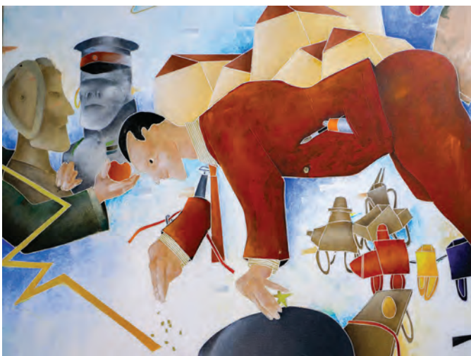
↑ Tadini Emilio , Lo sguardo del bambino (detail) , Acrylic on canvas, 1982