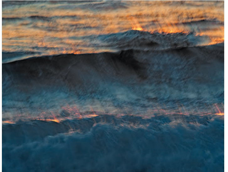
↑ Sharon D'Amico, Last Light 84 , Point Lobos - California, 2018