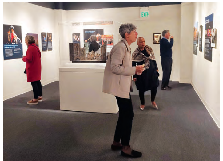
↑ Guests at the BRAVO exhibition opening night on May 4 th .