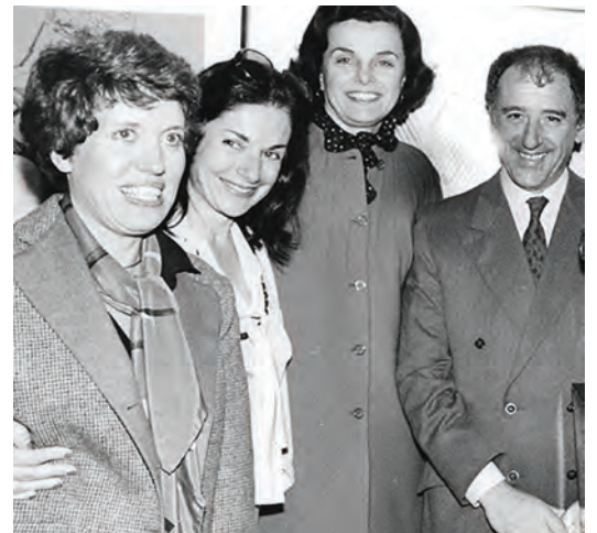
↑ Pictured in this 1984 photo are three of the Museo's early pioneers with then mayor of San Francisco, Dianne Feinstein.

We are making a full circle to our North Beach roots. We plan on celebrating our 50 th Anniversary in our new home.