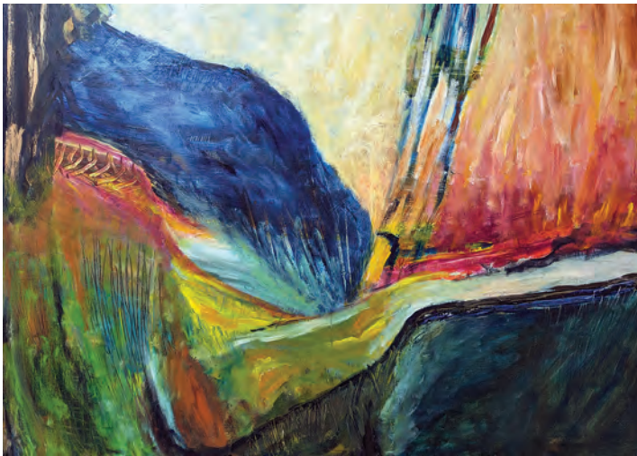
↑ Elena Civoli Brittain, detail, acrylic on wood

On view from April 23 rd through September 8 th , 2024 . Opening reception: Sunday, April 21, 2024, 4:30 PM