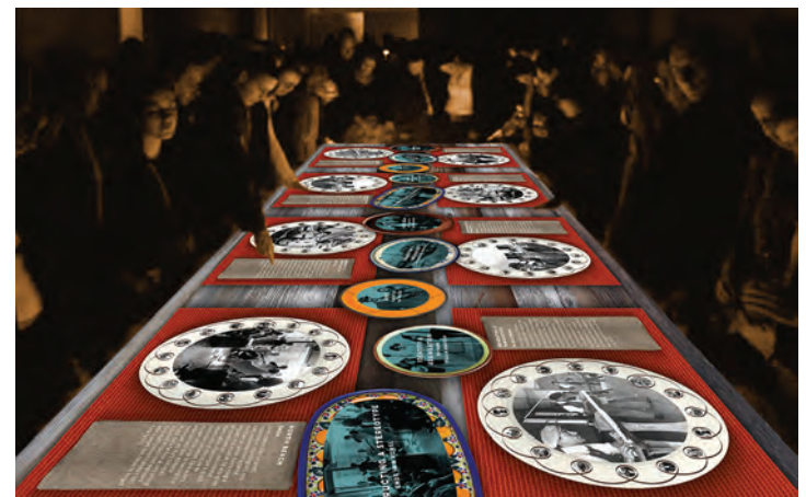
"Sunday Dinner," a dynamic touch surface table is the starting point of the future permanent history exhibit that will honor the achievements and journeys of Italian Americans. As a visitor arrives at their "setting," they see a series of virtual "dishes," each representing a grouping of stories from the exhibit themes. The visitor may drag a dish to their setting, or to another visitor across the table, to populate their plate with a story from this theme. The plate contains a photo or video, and adjacent text appears explaining the selection.

If you would like a tour of 940 Battery Street, please email mecca@sfmuseo.org to arrange a tour.